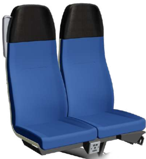
Vario Relax 3000