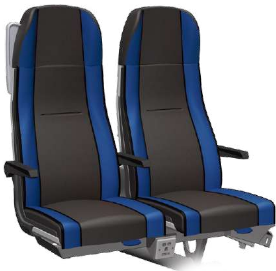
Vario Relax 3000R

The VARIO RELAX 3000 seat has been specially developed for daily use in commuter trains and regional trains. The seat consists of a self-supporting and robust aluminum structure and is highly crash-safe and fire-proof.