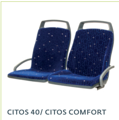
CITOS 40/ CITOS COMFORT