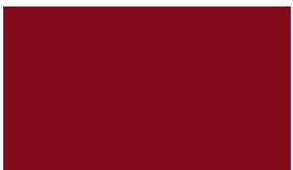
ruby red RAL 3003