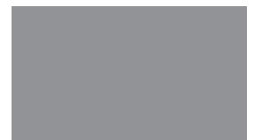
dusty grey RAL 7037